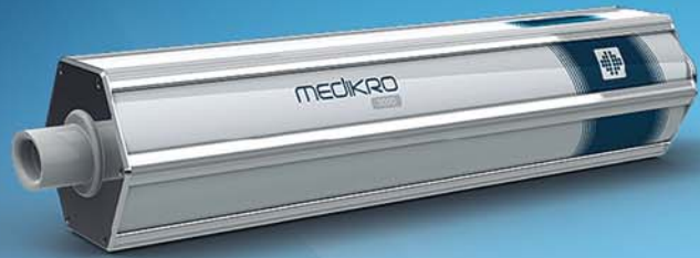
MEDIKRO® Calibration Syringe